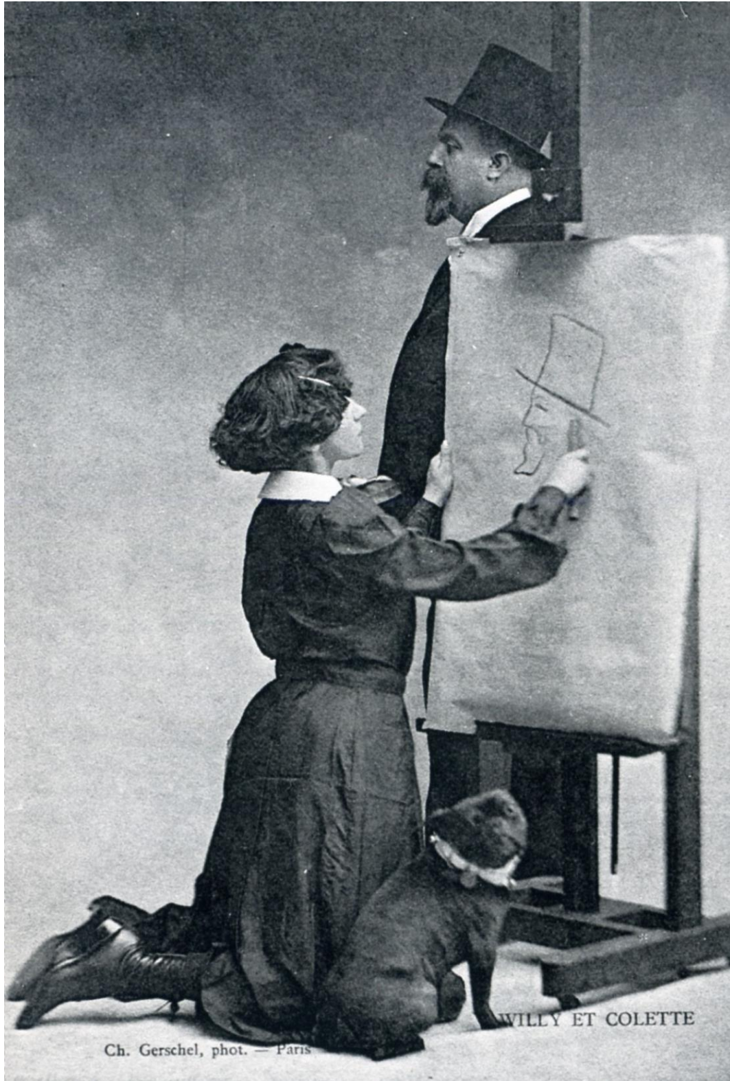
Image 3: Colette dressed as Claudine, posing with Willy.