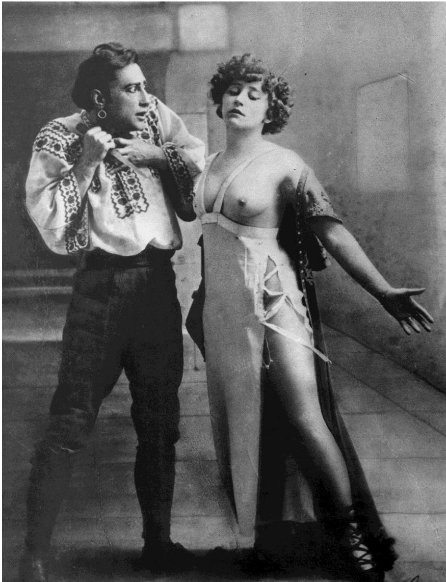
Image 1: Colette in La chair (1908).

[The following images accompany the article published in the French Review 93.3 (March 2020).]