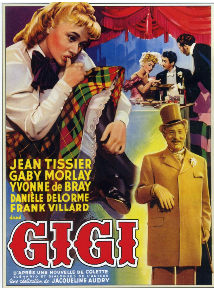
Image 2: Poster for the 1949 film, directed by Jacqueline Audry.